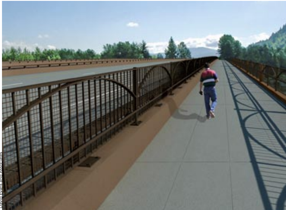
David Evans and Associates

Foundation conditions at the site can only be described as challenging from a design perspective. The bridge rests in a seismically active area with more than 100 ft of loose, saturated sand overlying the bedrock at the site. Because lateral forces that develop during an earthquake increase with the mass of the superstructure, the potential for soil liquefaction during a seismic event was analyzed extensively during design. Reducing the superstructure mass and weight not only helped to reduce potential seismic impacts, but also shrank the drilled-shaft size from the 10 ft diameter required for the concrete design to 8 ft for the steel bridges. Building smaller shafts also helped meet the environmental requirement to reduce the volume of material removed and replaced