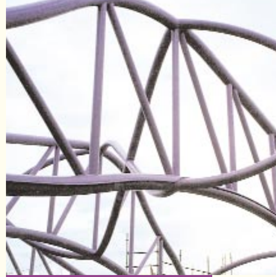
A fabric roof supported by free form trusses will shade guests waiting for the Sylvester McMonkey McBean's Very Unusual Driving Machines ride. In Seuss Landing, even the top and bottom chord truss bracing is curved.