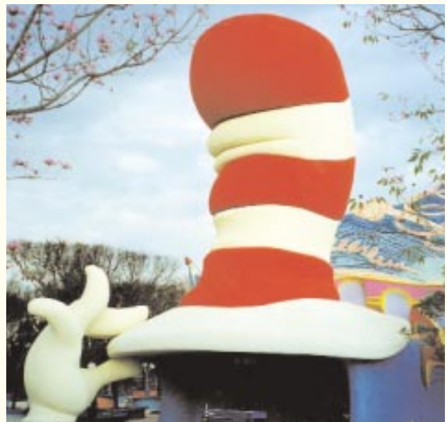
The completed 48' tall red and white striped hat is suspended above park guests as they enter the Cat in the Hat Ride at Seuss Landing.

tions in Dr. Seuss books. Then the architects and engineers used the renderings to produce two-dimensional design development plans and elevations, so the structures met functional requirements. Next, model builders used the design development drawings and the renderings to create scale models of each structure at 1/24 of actual size. The scale models were scanned to create digitized, three-dimensional models that were converted