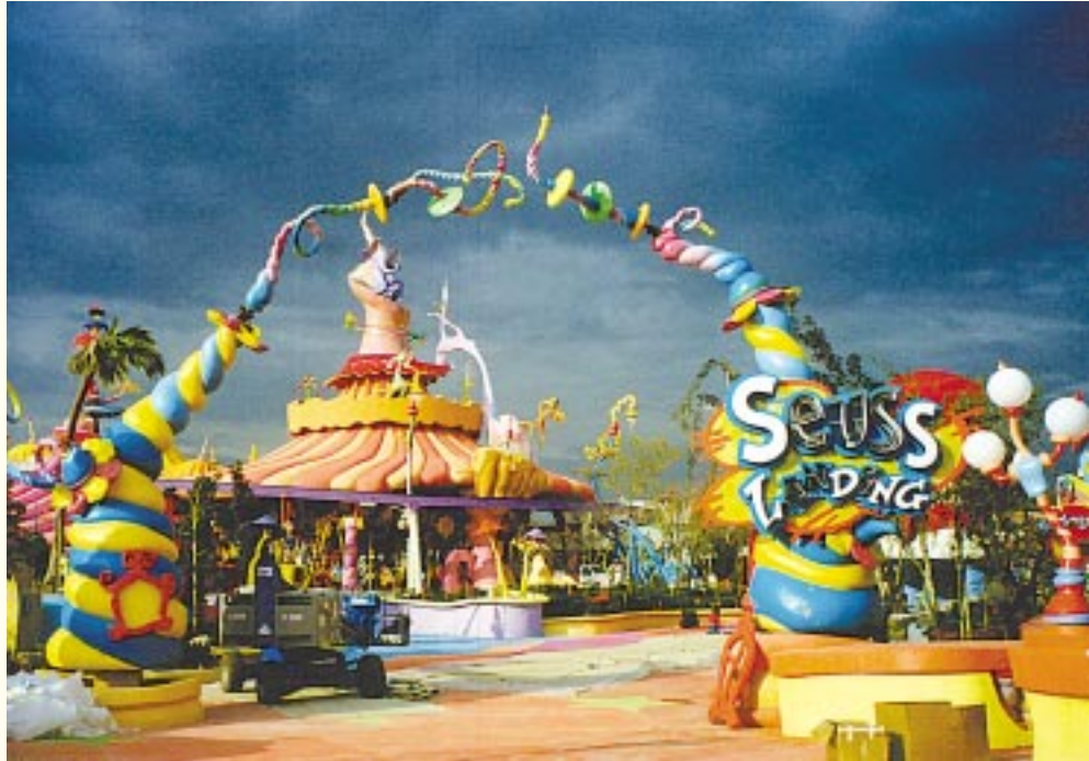
The Caro-Seuss-el as seen from the main entry to Seuss Landing. The Caro-Seuss-el is a merry-go-round where park guests ride on animals fashioned after the characters from the books of Dr. Seuss.

The imaginary worlds of Dr. Seuss are brought to life through the use of structural steel at Universal Studios' Seuss Landing attraction in Orlando, FL.