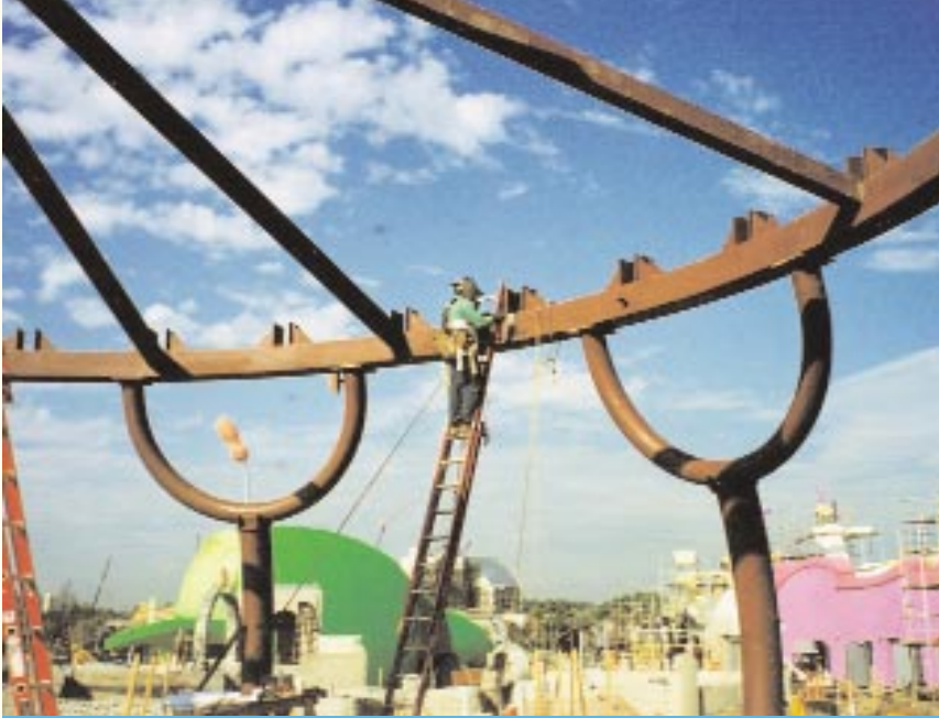
An ironworker prepares connections on the Caro-Seuss-el roof canopy tension ring. The roof canopy is an inverted funnel that appears to be flattened.