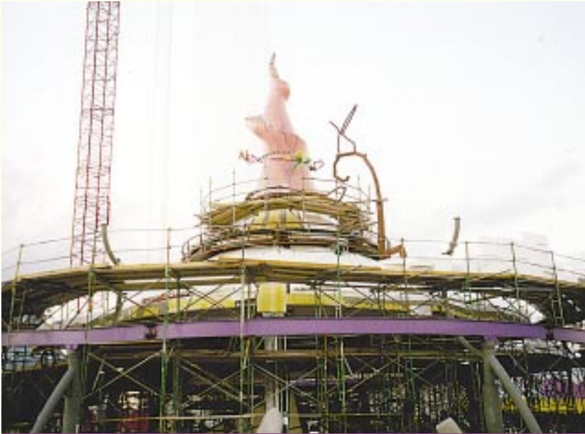
The Whozevwhatzit meanders skyward to the right of the Caro-Seuss-el roof canopy. Straight pipe sections welded together twist and turn in three dimensions to stay within the skin that was originally sculpted by the artists of Universal Studios.

the pipe section begins to violate the skin, a new straight pipe section is welded onto the previous pipe turning in a new direction. Thus, the Whozevwhatzit snakes its way upward changing directions in three dimensions, changing cross-sectional size and shape and sometimes branching into two sections like a tree. At one point, the turns are so radical that the pipe sections are only a few inches long. And in one area, the cross section is so narrow that only a 3 1/2" diameter pipe will fit inside the skin.